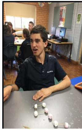
STEAM – space