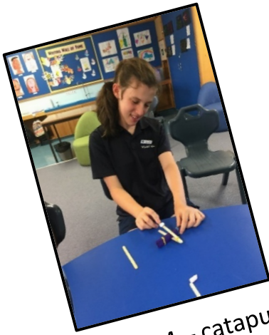
STEAM – catapult