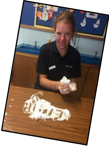
Spelling in shaving cream