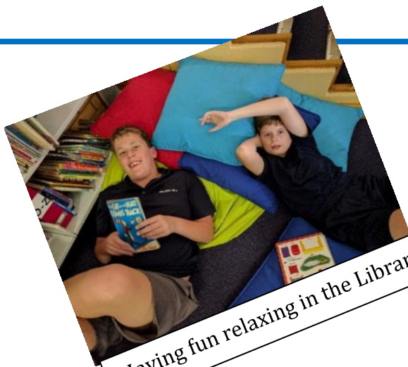
Having fun relaxing in the Library