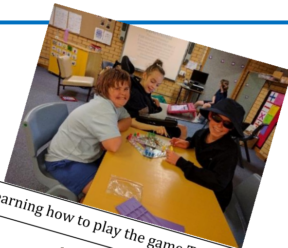
Learning how to play the game Trouble